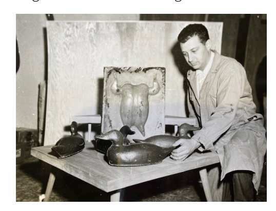
Roger's Fiberglass Class