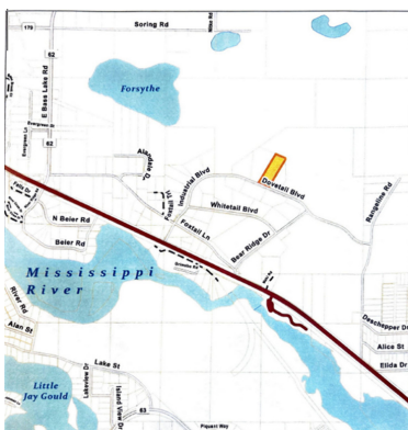
Location in Cohasset