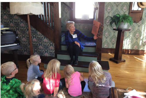
A Children's Discovery Museum program

Giving locally is a powerful and transformative act that not only benefits the immediate community but also has far-reaching effects on society as a whole. By investing time, resources, and energy in local causes, individuals and organizations can build stronger communities, meet local needs, empower individuals, create a culture of generosity, and foster long-term positive change. Ultimately, giving back to the community is an essential step towards creating a more compassionate, equitable, and interconnected world.