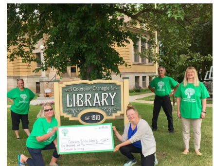
Greenway Area Community Fund members with their donation for the Coleraine Library