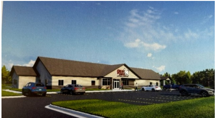
Proposed Building Drawing

You can donate online at www.gracf.org/donate and search for Great Tails Animal Rescue Building Fund or mail or drop off a check to GRACF at 350 NW 1st Avenue, Suite E, Grand Rapids.