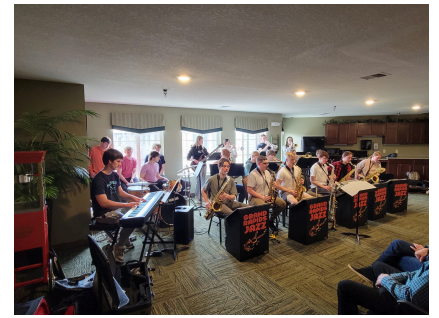
GRHS Band with new keyboard